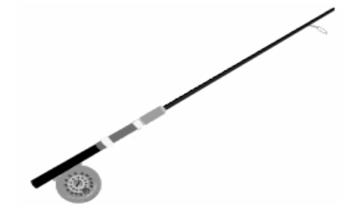
Sample Fly Fishing Rod & Reel