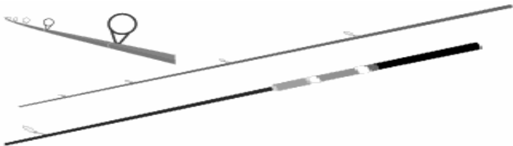
Sample Fishing Rods