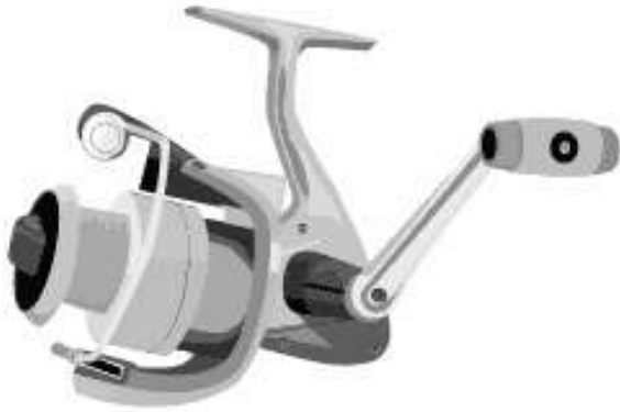
Sample Spin Casting Reel